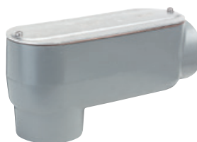
SOLB-8, 9, 0