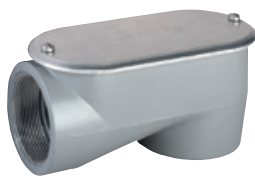
SLB-1 thru 7